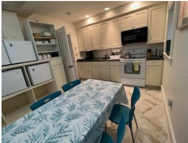
Shared guest kitchen