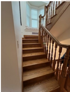
Rooms and guest kitchen involve stairs. There are no handicapped accessible rooms.