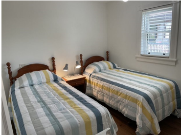
A guest room