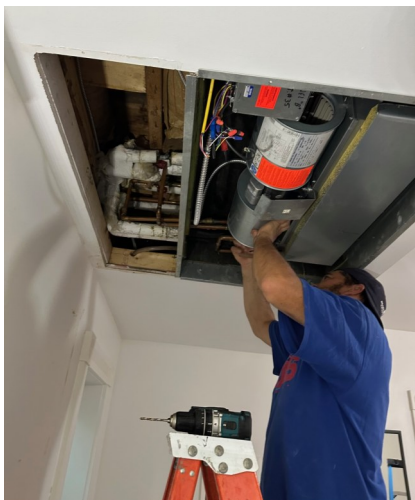
Installation of new HVAC system underway