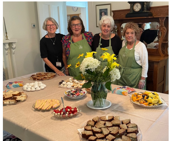
Preparing to welcome visitors to a Tuesday social at Catholic House