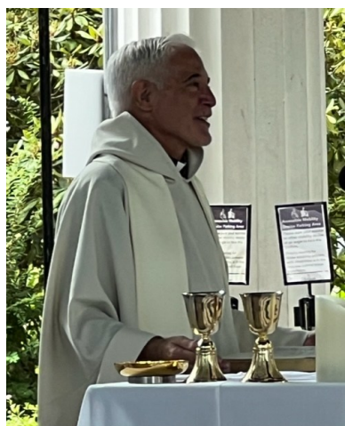
Our Chaplains presided at 63 Masses at Chautauqua in 2023.

Our priests who serve as weekly Chaplains at Catholic House make possible a spiritual and meaningful Catholic experience at Chautauqua. Whether you are a guest for a week, a visitor at our Tuesday socials, or just stopping by our Blessed Sacrament Chapel for a quiet moment of prayer, there is something special about having a Catholic presence on the grounds of Chautauqua. Without our Chaplains, we would not be able to offer weekend and weekday Masses, Reconciliation, or our enormously popular and inspiring Thursday and Friday afternoon seminars.