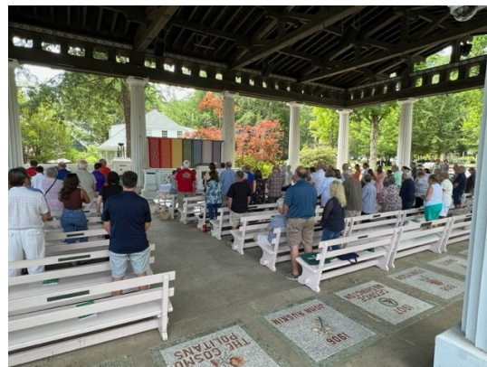
Weekend Mass in the Hall of Philosophy