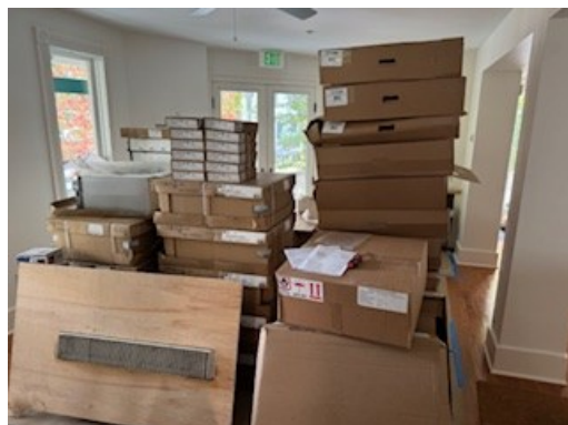
New HVAC components delivered to Catholic House

We would be most appreciative of any contributions to help us with this major expense to care for our treasured Catholic House. Please make checks payable to Chautauqua Catholic Community, Inc., P.O. Box 106, Chautauqua, NY 14722. We are deeply grateful for support of this important project.