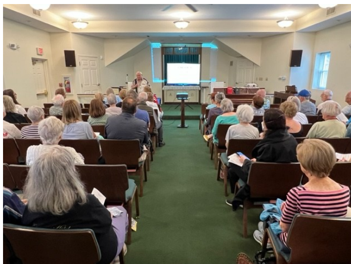
Our Chaplains conduct 18 Catholic seminars each season in the Methodist House Chapel

Attached to this newsletter, you will find a sheet regarding sponsorship opportunities to help support visits by religious sisters and priests, and our priests' seminars. Your support is so important to us in handling the many costs associated with providing this special Catholic presence at Chautauqua. Your tax-deductible donations to Catholic House are our only means of support, and we thank you!